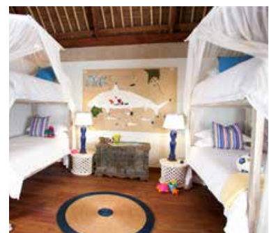
TABLE OF FACTS